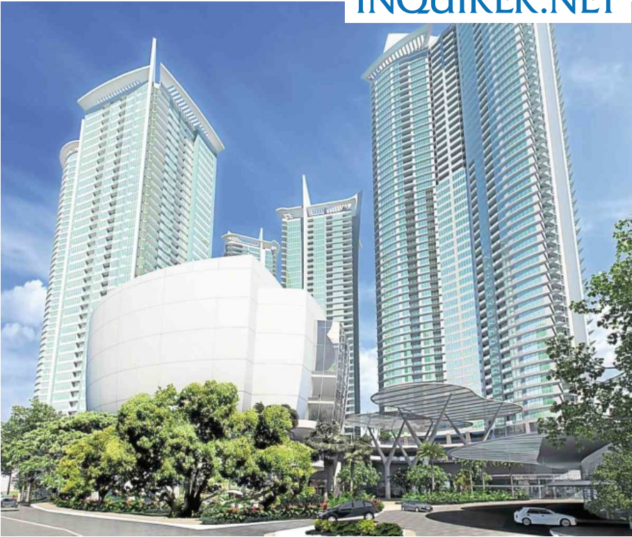
THE PROSCENIUM will anchor the property's five residential towers.

For the Proscenium, Ott designed towers with fewer units for each floor—an average of four, with cuts measuring as big as 300 square meters. The two- or three-bedroom units will have balconies with different views, depending on which tower the unit is located.