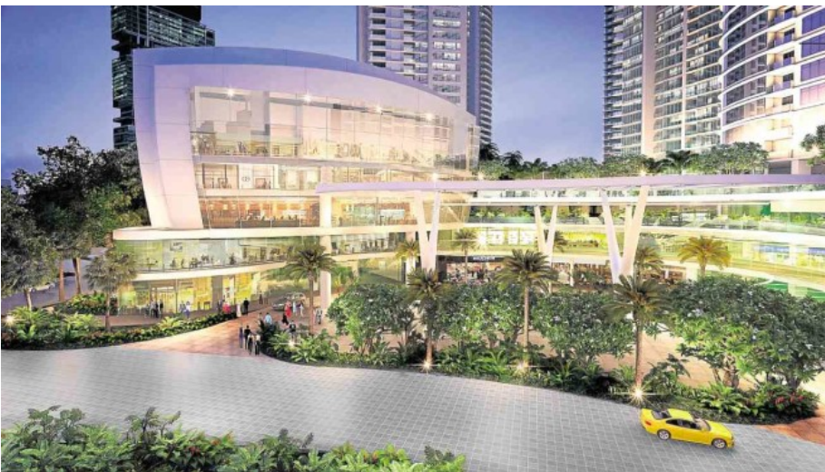
SPACIOUS and well-lighted with a lot of greenery